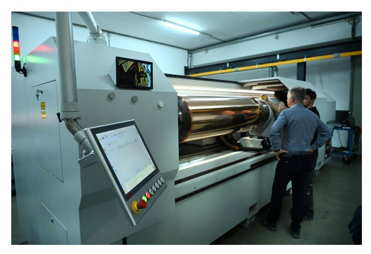
Chiyoda specializes in printing motifs for manufacturers of laminate floors, among others.

Over the past two years, the LRM has invested 40 million euros within this program in strengthening and anchoring ten companies such as Ellimetal, Fryns, A&M Invest and Punch Metals. The LRM thus not only provides input with one of the numerous financial instruments, the companies also enjoy extensive strategic and substantive support. Although originated during corona, the aim is to help healthy companies grow and innovate, even if they have not been affected by the crisis.