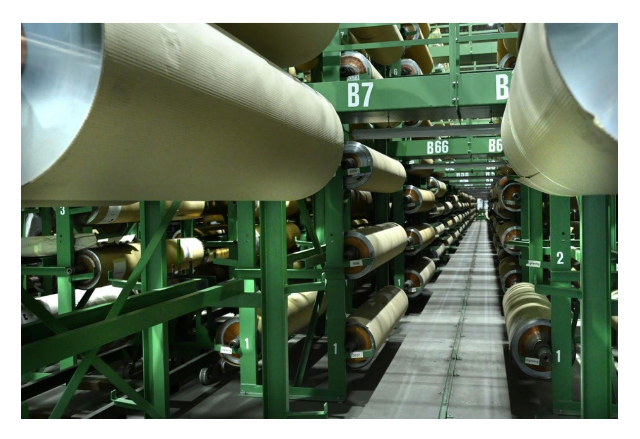
The warehouse where print rolls are kept.